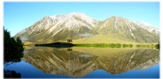
Lake Pearson/Moana Rua was carved out by ice-age glaciers and is today an important wildlife refuge.

Settle in, relax and let us help you to explore the Southern Alps and experience life on a working sheep farm.