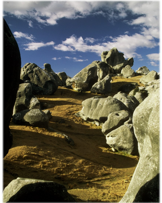
The limestone castles of Kura Tawhiti

As you sidle high above the braided gravels and clear channels of the Waimakariri River, look up the valley to the pastures of the Wilderness Lodge farm and the peaks of Arthur's Pass National Park beyond. Carefully cross the one-lane bridge over Broad Stream and after another 500 metres turn left at the sign for the Wilderness Lodge. Follow the driveway and signage up to lodge carpark. Park and then walk the short path beneath an ancient beech tree to reception. One of our team will be there to greet you.