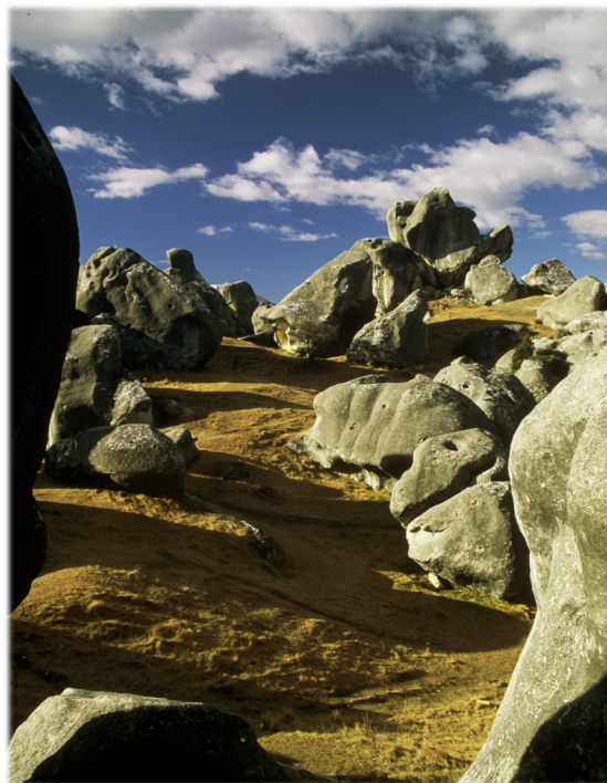
The limestone castles of Kura Tawhiti

The Highway is flat and straight, passing through the productive farming land of the Canterbury Plains. Created by gravels washed out from the Southern Alps by large braided rivers, this land has traditionally been used for mixed cropping, though much has now converted to dairying with the introduction of large scale irrigation. 10km past Springfield is the tiny village of Sheffield, home to a famous bakery. If you want to try a traditional New Zealand meat pie, this is your chance!