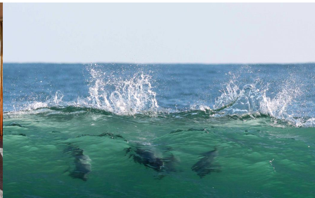
A pod of Hector's dolphins riding a wave on our Wilderness Seacoast Adventure Walk